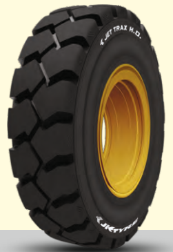
JET TRAX HD 12.00-24 24PR