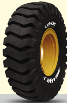
VEM 99 E3/L3/L4 17.5-25 16PR/20PR | 20.5-25 20PR/24PR 23.5-25 20PR | 26.5-25 28PR 29.5-25 28PR/34PR | 29.5-29 28PR