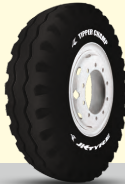
TIPPER CHAMP (M&L) 10.00-20 18PR 11.00-20 18PR