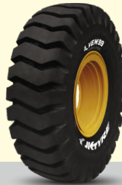
VEM 99 E4 'SS' 18.00-25 40PR