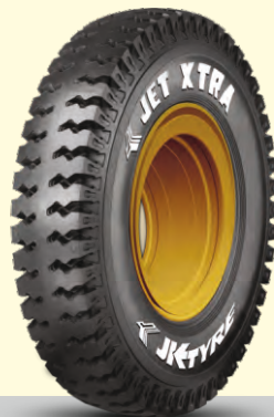
JET XTRA IND 8.25-16 16PR