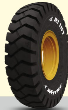
JET LIFT 6.50-10 10PR | 7.00-12 12PR