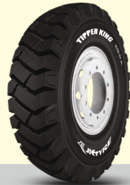
TIPPER KING (M&L) 12.00-20 18PR 12.00-24 20PR