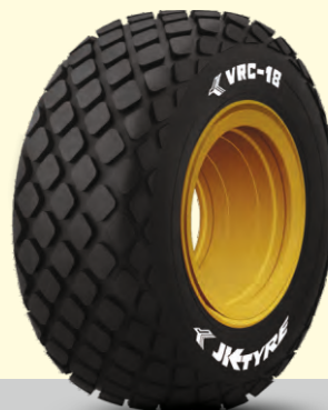
VRC-18 R3 23.1-26 8PR/12PR/16PR