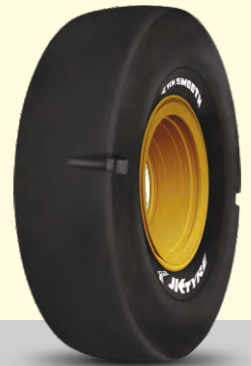
VEM SMOOTH 'L4 S'/'L5 S' 18.00-25 40PR