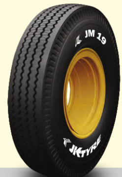
JM 19 IND 7.50-16 16PR 8.25-16 16PR