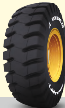
VEM 045 XD E4