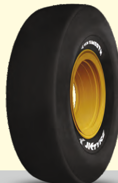
VEM SMOOTH 11.00-20