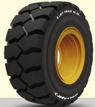
JET TRAX HD 10-16.5 10PR 12-16.5 12PR