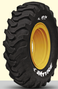
EG 04 G2 13.00-24 12PR/16PR 14.00-24 12PR/16PR