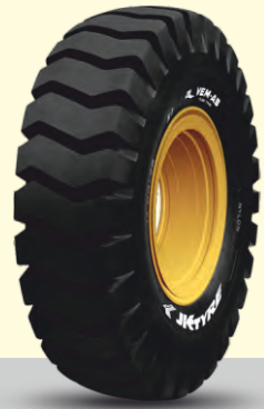
VEM AS E3/L3 14.00-24 20PR/24PR/28PR 14.00-25 12PR/20PR/24PR