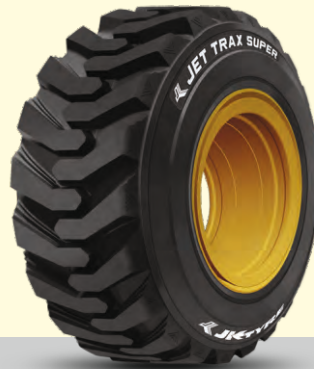
JET TRAX SUPER 10-16.5 10PR 12-16.5 12PR