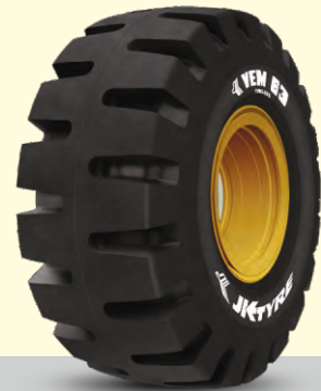
VEM 63 L5 35/65-33 32PR/42PR