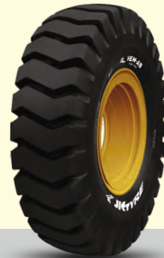
VEM AS E3 14.00-20 22PR