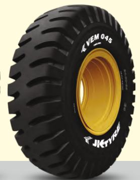
VEM 045 E3/E4