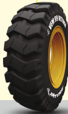
VEM 99 ULTIMA 9.00-16 16PR