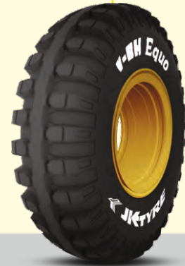
V-BH EQUO IND 9.00-16 16PR