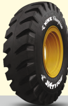
MINE CHAMPION E4 14.00-25 36PR