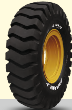
VEM AS E3/L3 14.00-25 12PR/20PR/24PR