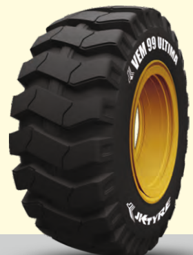
VEM 99 ULTIMA 16/70-20 16PR