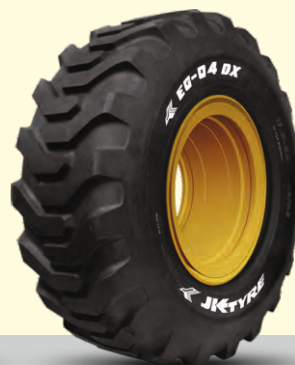
EG 04 DX G2 15.5-25 12PR 17.5-25 16PR