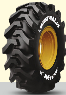
INDUSTRIAL DX I-3 12.5/80-18 12PR/16PR