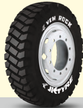
VEM ROCK M&L 10.00-20 18PR 11.00-20 18PR 12.00-24 20PR