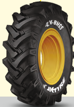
V-BHSS R4 16.9-28 12PR