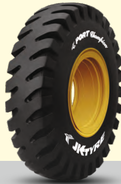
PORT CHAMPION IND-4 18.00-25 40PR