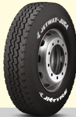
JUC4 JETWAY - CRANE 11.00R20 16PR | 12.00R20 18PR | 12.00R24 20PR