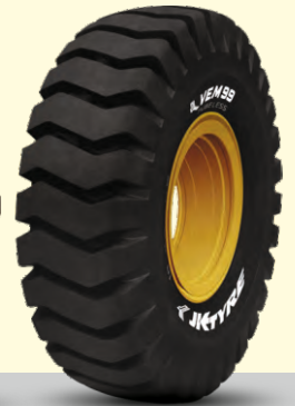
VEM 99 E3/L3 18.00-25 12PR