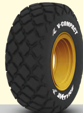
V-COMPACT R3 23.1-26 8PR/12PR