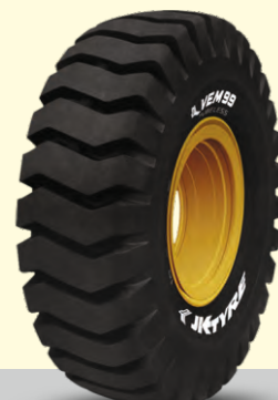
VEM 99 IND-3 18.00-25 40PR 21.00-25 40PR