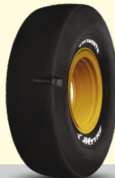
VEM SMOOTH 9.00-20 16PR 7.00-12 16PR