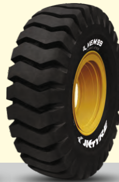
VEM 99 E3/E4