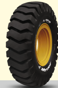
VEM AS IND-3 14.00-24 28PR