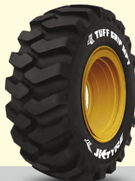
TUFF GRIP MPT 16/70-20 14PR