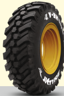
V-BH CHAMPION R4 16.9-28 12PR