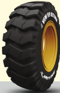
VEM 99 ULTIMA 16/70-20 16PR