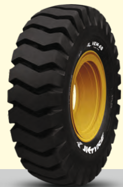
VEM AS E3/L3 14.00-24 16PR 14.00-25 12PR/20PR/24PR