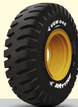
VEM 045 IND-3 16.00-25 32PR