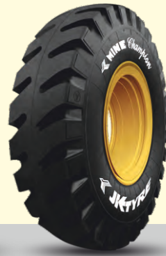
MINE CHAMPION L4 14.00-25 36PR