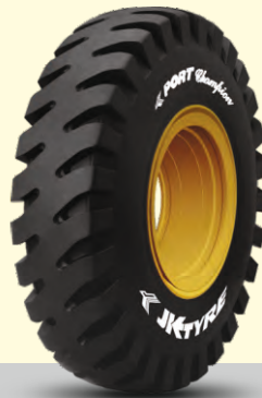
PORT CHAMPION IND-4 14.00-24 28PR