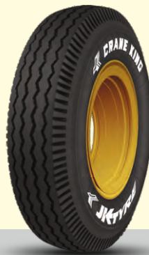
CRANE KING 10.00-20 16PR 11.00-20 16PR/12.00-20 18PR