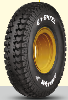
V-BHTEL IND 9.00-16 16PR