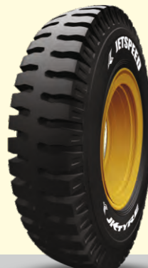
JET SPEED IND 7.50-16 16PR