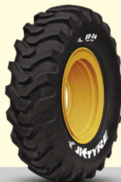
EG 04 G2 13.00-24 12PR/16PR 14.00-24 12PR/16PR