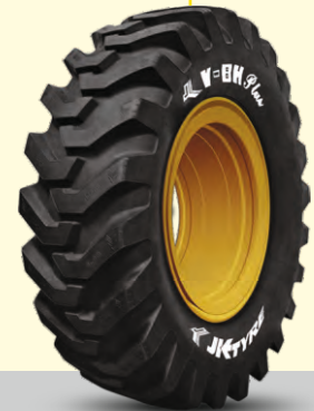
V-BH PLUS R4 16.9-24 12PR | 16.9-28 12PR